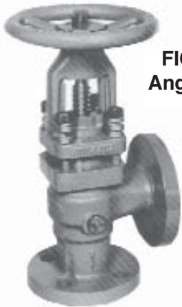
FIG. B6561 Angle Pattern