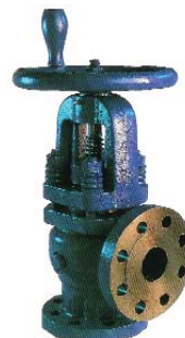
ANGLE VALVE — FLANGED Iron body, Fig. 3482-R Steel body, Fig. 3486-R (1 1/2", 2", 3 1/2")