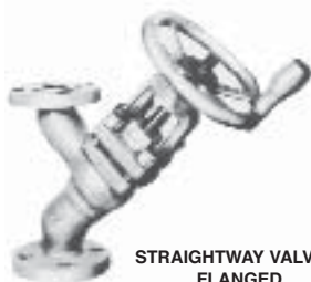
STRAIGHTWAY VALVE— FLANGED Iron body, FIG. 3484-R Steel body, FIG. 3488-R