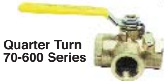
Quarter Turn 70-600 Series

BALL VALVES in Bronze Reinforced Teflon* Seats and Stuffing box Seals 150 P.S.I. Saturated Steam Vacuum Service to 29" Mercury