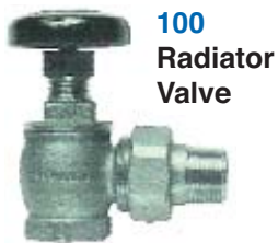
100 Radiator Valve