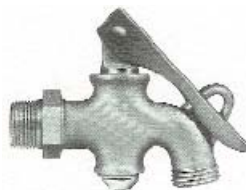
No. 252 Hose End 3/4" I.P.