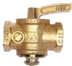
Manual Main Control Valve