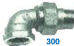
300 Radiator Fittings

Union elbow, male union, female pipe inlet