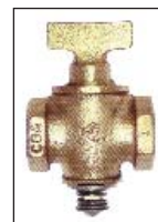
TEE HANDLE WITH CHECK