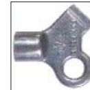
No. 2404 Keys Only for Air Valves.