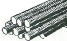
1/4" Thru 1" - Plated 1 1/4" Thru 1 1/2" - Unplated