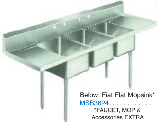
Below: Fiat Flat Mopsink* MSB3624.....