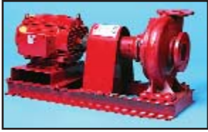
1510 Stock Series