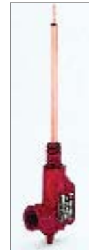
Airtrol Tank Fitting