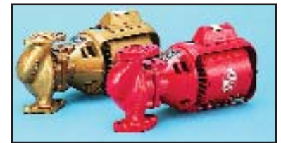
75-150, PR, HV, PD Series