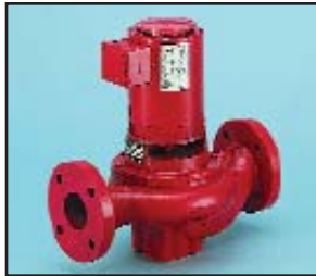
Series 80 In-Line Pump